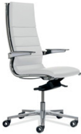
① Leather executive chair. For dimensions, see price guide, p. 200

Visitor chair with hard-wearing tubular steel cantilever frame in a chrome finish.