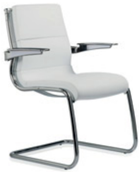
② Leather cantilever chair. W. 69 x D. 65.5 x H. 92.5 cm