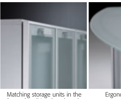
Matching storage units in the form of traditional cupboards and deco bookcases

Surf Design's comprehensive selection of glass furniture for executive offices and boardrooms provides the perfect environment in which to escape the tumult of the modern world.