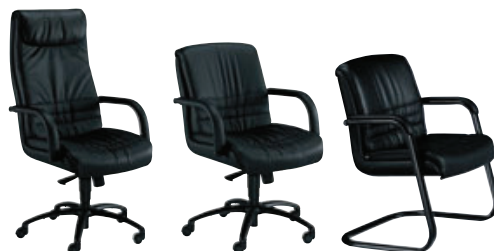
④ High back chair ⑤ Low back chair ⑥ Cantilever visitor chair