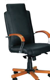
① Executive chair with integral headrest