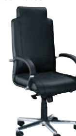
③ Executive chair with integral headrest