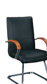
② Cantilever chair