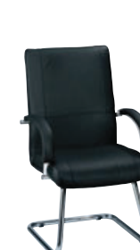
④ Cantilever chair