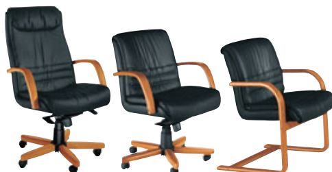
① High back chair ② Low back chair ③ Cantilever visitor chair